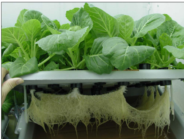
Figure 1. Collard plants ( Brassica oleracea var. acephala ) growing in hydroponic solution containing heavy water. The lid on the growth container has been raised to reveal the root systems. Plants are four weeks old.

In order to label beta-carotene, plants can be grown hydroponically using a nutrient solution enriched with heavy water. Each molecule of heavy water, or deuterium oxide, contains two atoms of deuterium instead of two atoms of H-1. Plants absorb both heavy water and normal water via the root system and transport the water to their shoot organs, where the hydrogen or deuterium ions can be utilized in various biochemical reactions. Using this approach, we have successfully grown spinach, collard (Fig. 1), broccoli, carrots and other vegetables, and have achieved a labeling of the beta-carotene pool with a high yield of the M + 8 isotopomer. Because deuterium atoms are inserted randomly throughout the molecule (Putzbach et al., 2005), a range of isotopomers is produced (Fig. 2); however, we